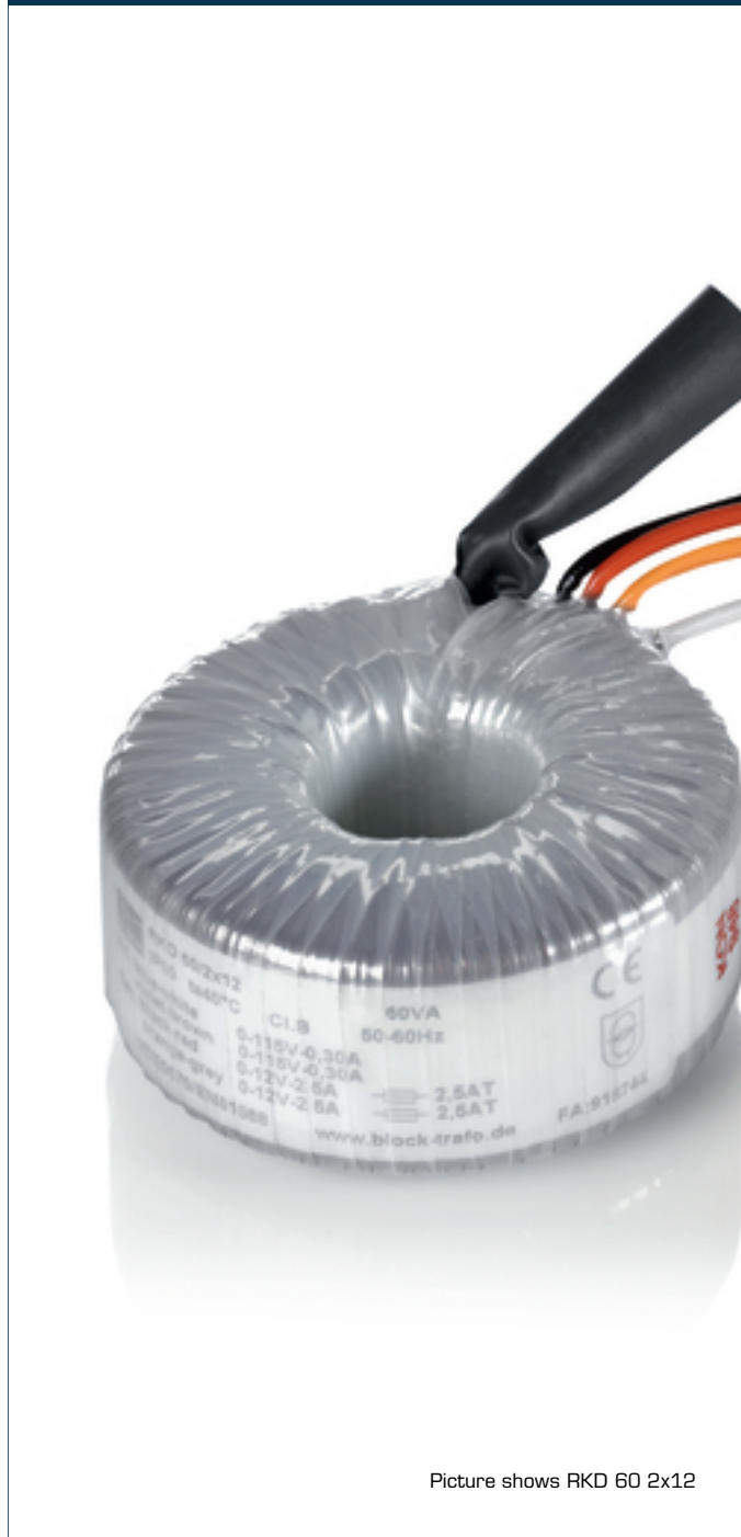
Picture shows RKD 60 2x12